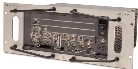
Network Information Computer (NIC EP)

The NIC EP can also be configured with the new single-board optical multirate modules, providing equipment manufacturers and service providers with a cost-effective, high-speed, high-density solution for OTN—as well as 10G and 2.5G interfaces—in a single portable platform.